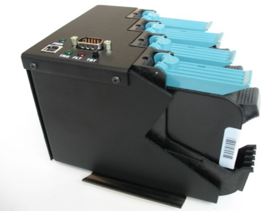
XiJet HP Print Technology